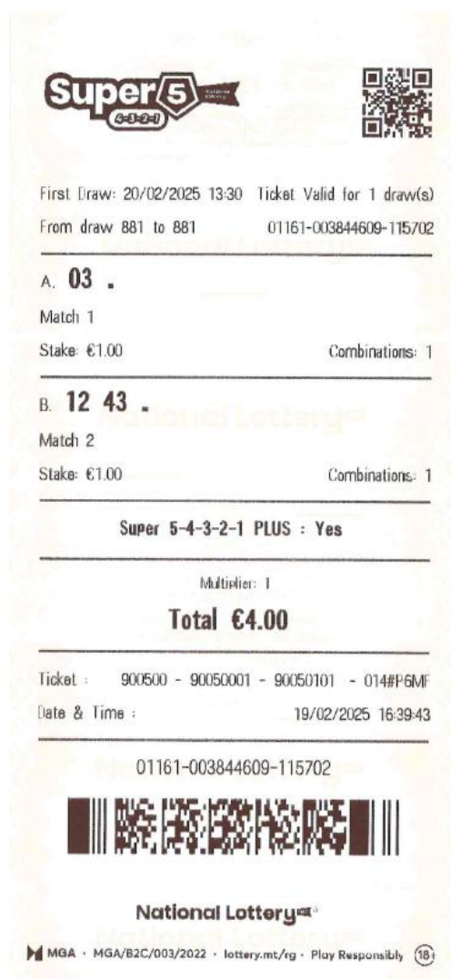
Figure 1: The indicative Super5-4-3-2-1 Ticket Receipt

The ticket is the unique valid document for claiming winning prizes. The following is an illustration that represents a visual of the Super 5-4-3-2-1 ticket, including the information displayed on the ticket.