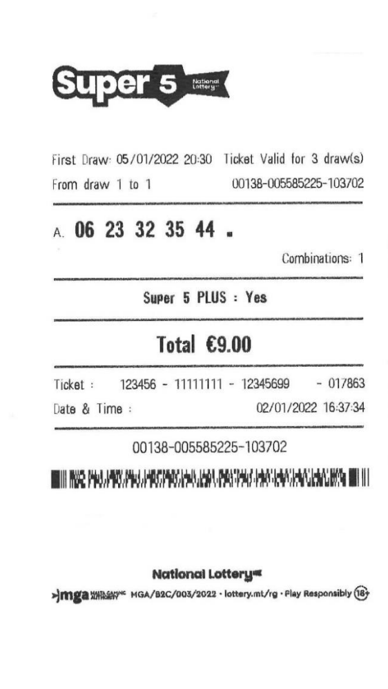
Figure 1: The indicative Super5 Ticket Receipt

The ticket is the unique valid document for winning prizes. The following is an illustration that represents a visual of the Super5 ticket, including the information displayed on the ticket.